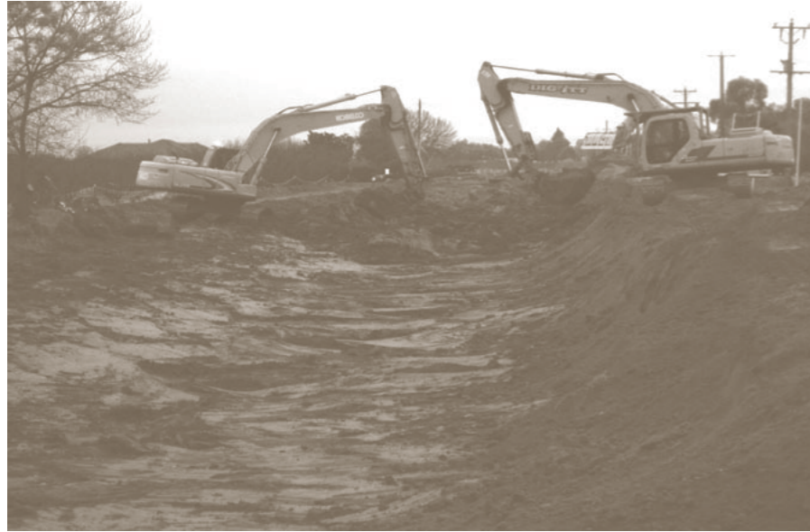
Contractors preparing the MV No 1 channel for plastic lining near Cobram.

Winter works are currently underway in the Murray Valley Irrigation Area to help improve service delivery for the coming season. G-MW will replace a bridge on the MV No3/5 channel and also make repairs to a syphon on the MV No6/5 channel this winter. Customers and members of the public are reminded to be mindful while moving around the works areas due to the increase in traffic.