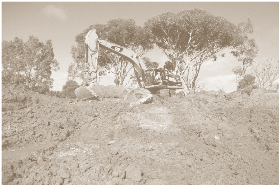
Replacing 5 subways along the Waranga Western Channel between the 74km and 85km regulators.

Winter works are currently underway in the Rochester Irrigation Area to help improve service delivery for the coming season. G-MW will replace five Waranga Western Channel Subways on McColl Rd between Restdown Rd and Brickchurch Rd this winter. Customers and members of the public are reminded to be mindful while moving around the works areas due to the increase in traffic.